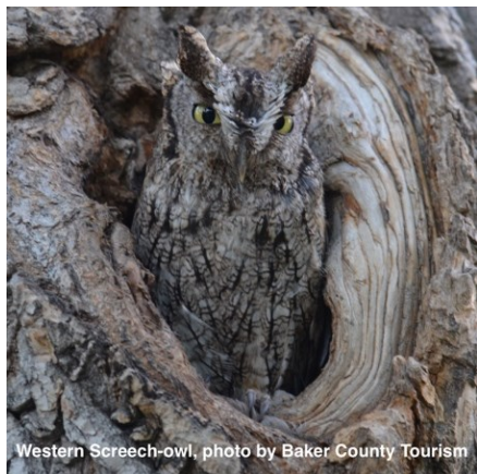
Western Screech-owl

Dead cottonwoods and even invasive tree species provide critical nesting sites for birds in the Grand Valley. Unless a dead tree could fall on a structure, road, or pedestrian trail, consider leaving it standing. Bird species in the Grand Valley that depend on dead trees or dead limbs for nest sites include Western Screech-owls, Wood Ducks, Northern Flickers, American Kestrels. Larger birds like Great Blue Herons, Bald Eagles and Osprey also commonly place their nests in large dead