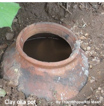
Clay olla pot

The most important factor for revegetation success is water. Even plants that tolerate very dry conditions need water to get established- the process of being transplanted from a nursery pot into the ground is not the same as germinating naturally from seed. It is crucial to have a plan in place to water revegetation plantings, otherwise their success rate will be very low.